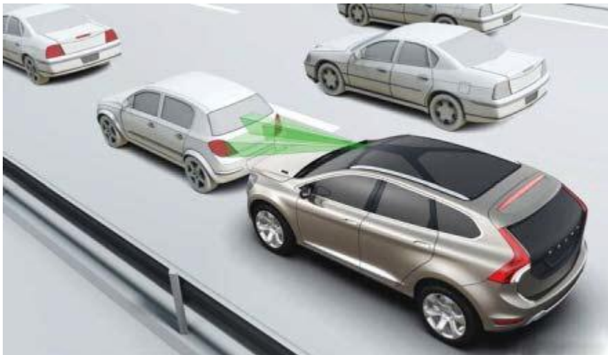
Radar, lasers or camera keep an eye on traffic ahead.

Automatic braking systems may use a combination of short and long range radar sensors mounted in the bumper or grille to detect what's going on in front of a vehicle, or Lidar (laser range detection) sensors and/or optical cameras mounted between the rearview mirror and windshield to "see" what's going on ahead of a vehicle. Radar-based systems will typically sense objects in the road ahead up to a distance of about 80 to 100 yards (the length of a football field). Some systems will look further ahead (up to 200 meters or more) depending on the speed of the vehicle and the maximum speed it is designed to remain active (some systems only work at speeds of 30 to 50 mph or less).