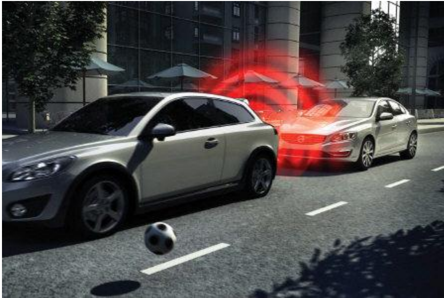
Automatic braking can react to emergencies when a driver does not.

The latest innovation is braking systems that anticipate the need to brake (collision warning) and actually apply the brakes (autonomous braking) to avoid or reduce the damage caused by a collision. These technologies combine elements of "brake assist" with "adaptive cruise control" to take braking safety to the next level.